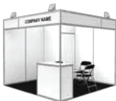
Exhibit Space Cost